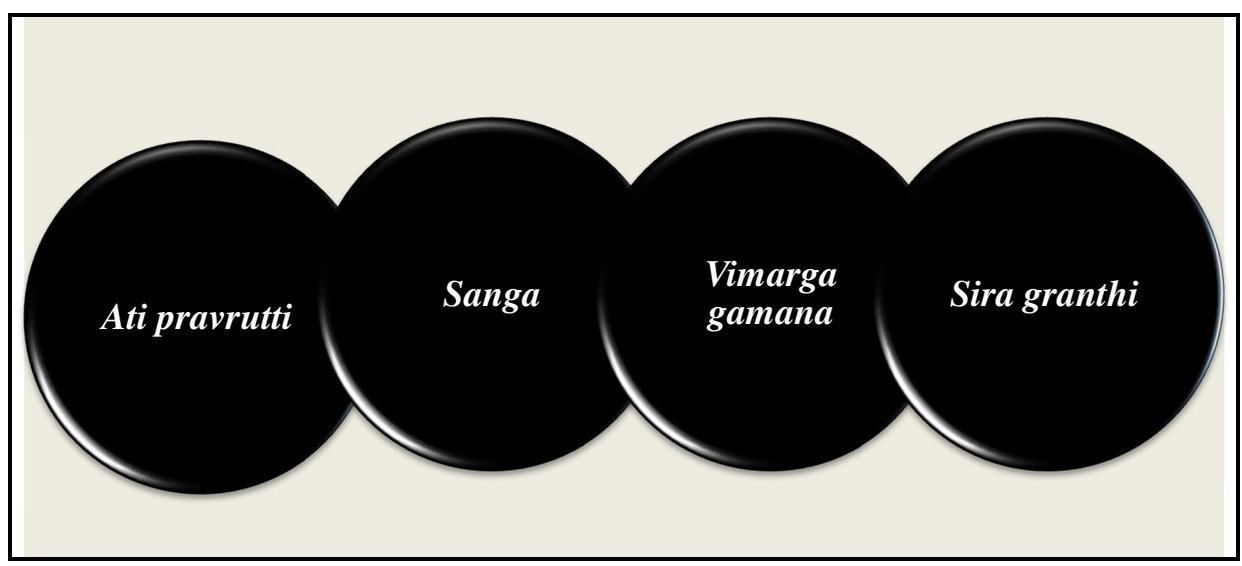
Figure No.1: Major pathological events related to Srotodusti